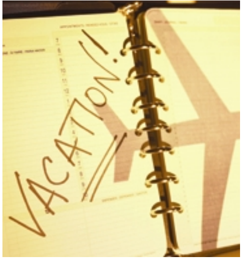
Staying healthy is key to a good vacation.

paying attention to your body's needs, you'll be able to fully enjoy your trip.