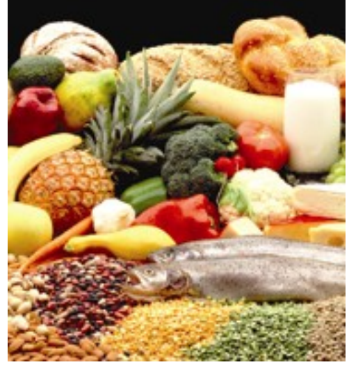
Organic foods are free of pesticide residue.

"Organics are better for the environment, and it's an investment in the revitalization of rural America," Scowcroft says. Organic farms are usually smaller, family-owned farms contributing to the economy of struggling rural America, he explains. The organic choice may be a little more expensive, but it's an investment in your health and the future.