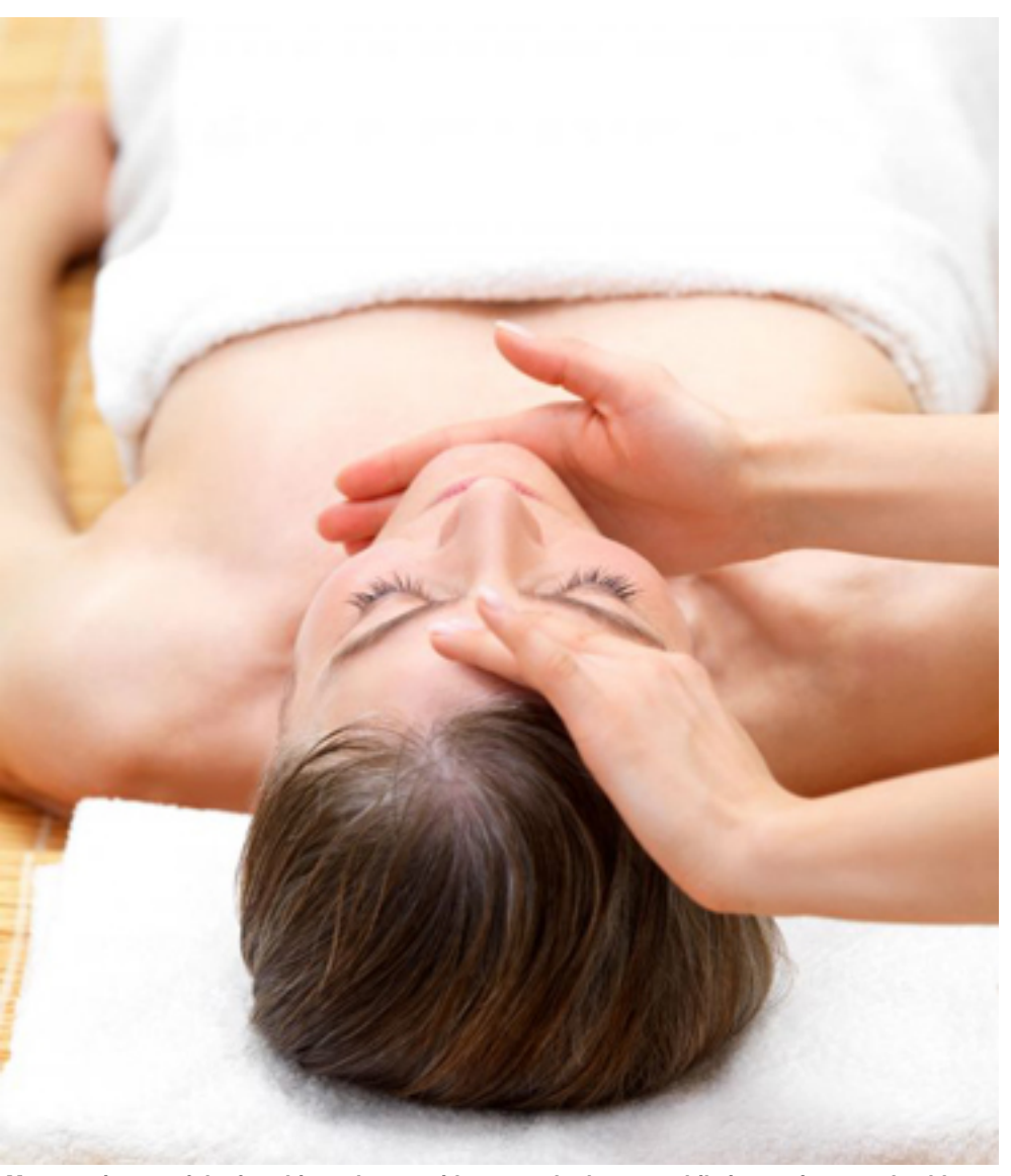
Massage is one of the few things that provide so much pleasure while improving your health.

While bodywork feels like a luxurious mini-vacation, and you should by all means enjoy it, there is an actual physical need for massage. Maintaining a regular massage schedule will help you operate at your peak level--whether it be at work, at home, or at play. Invest in yourself, and book a massage today.