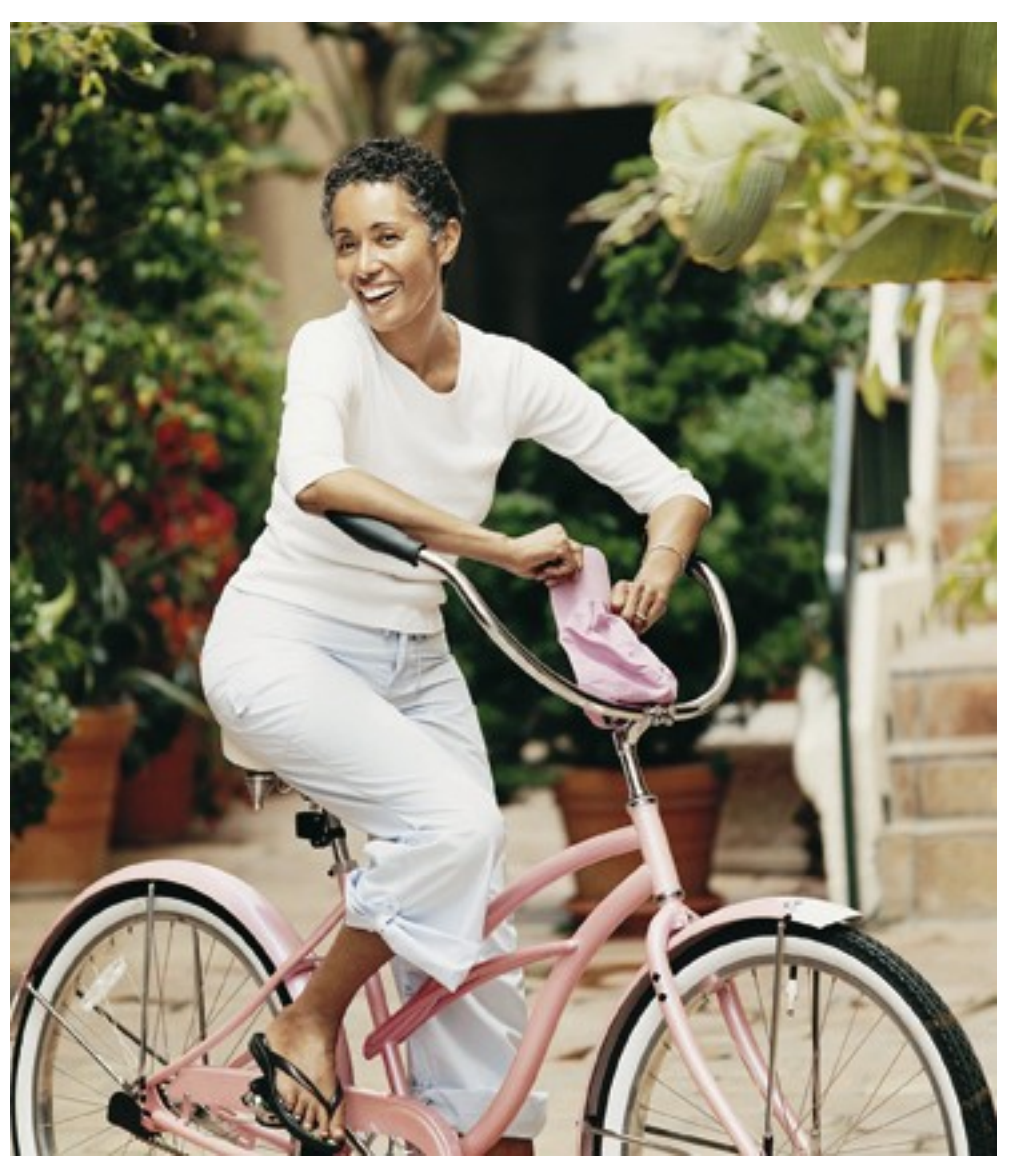
Free yourself from the often debilitating discomfort of fibromyalgia and take back your life.

Fibromyalgia is a soft tissue condition, and bodyworkers are experts at working with soft tissues. By including massage in your care, you can expect to manage and improve your fibromyalgia.